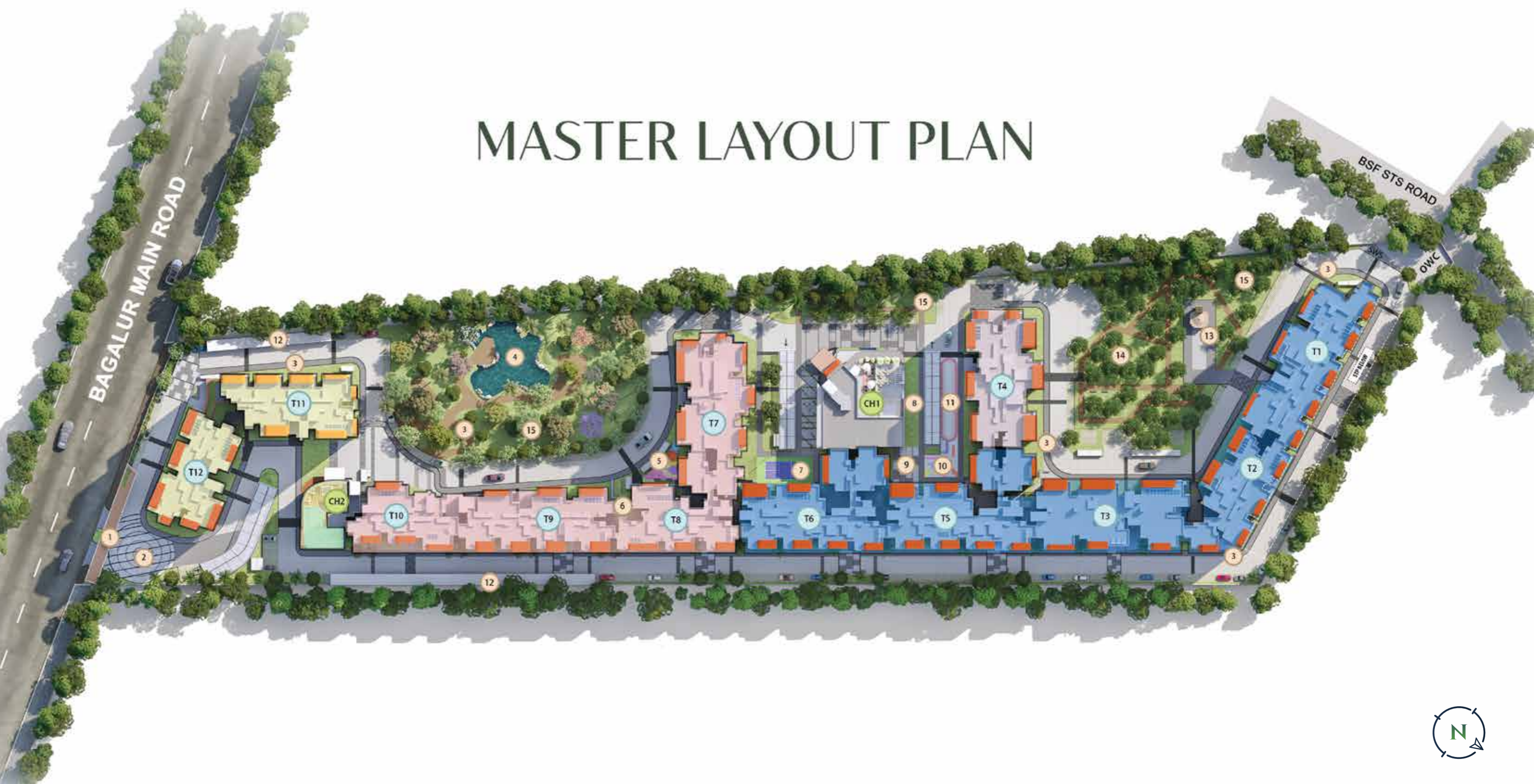
Master layout plan.